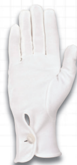
SB01169M BUTTON WRIST

An essential item for special occasions and events in law enforcement, our unlined cotton ceremonial gloves have classic design features and are available with either a button fastening or a pinch of elastic at the wrist. Manufactured in the UK and made from British cotton simplex fabric, these are the finest ceremonial gloves currently available anywhere in the world. Made without compromise, they will provide years of service for those important engagements such as dinners, graduations, weddings and funerals.