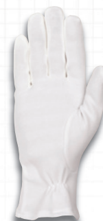
SB01167M ELASTIC WRIST